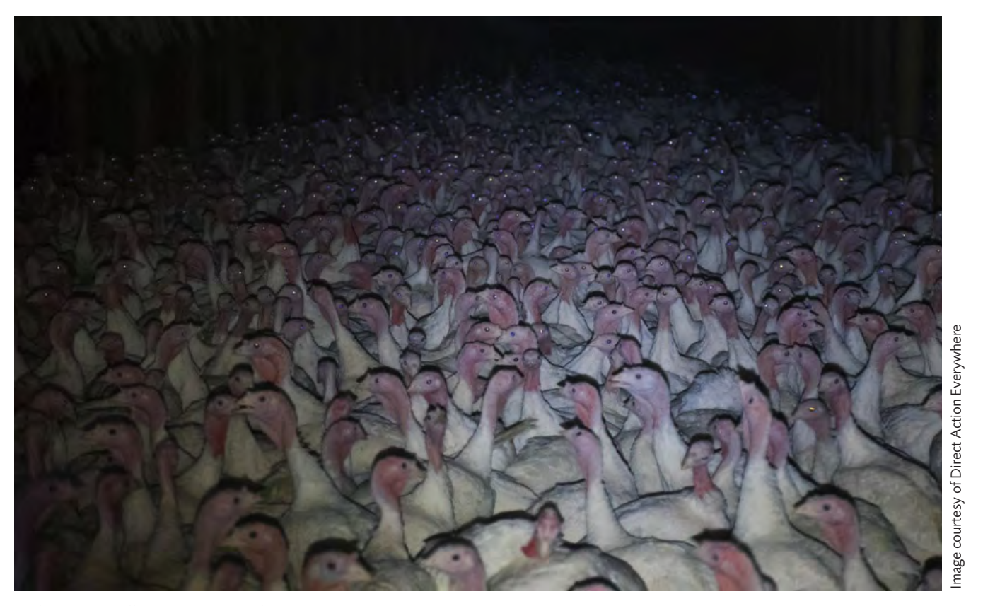
Turkeys at Jaindl Farms in Pennsylvania.

plaintiffs argued that the broad, sweeping law is unconstitutional for many of the same reasons as more targeted ag-gag legislation, specifically, that the law stifles their ability to investigate employers for illegal or unethical conduct, and restricts information from these investigations, in violation of the First Amendment and Equal Protection.