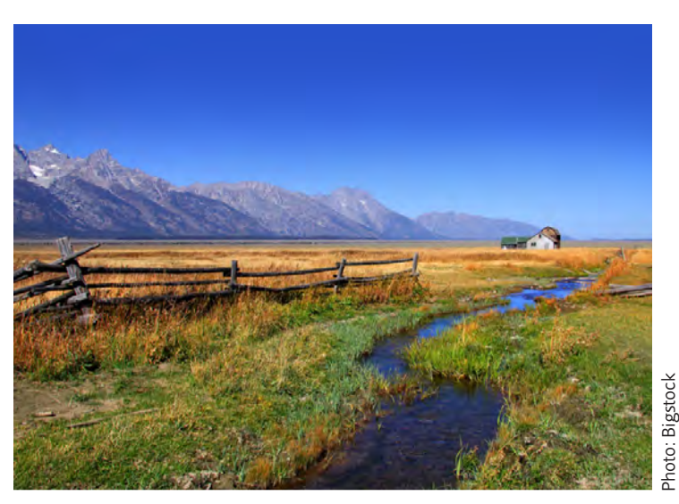
Wyoming's ag-gag law would make it difficult to test the quality of water in streams like this one.

In response to legal challenges (see below) the Wyoming legislature amended both data trespass laws in 2016. "Open lands" was replaced by the phrase "private land" and the definition of "collect" was altered to strike the requirement the data be submitted or intended to be submitted to government agency. Despite that change, access to open lands remains restricted for animal rights and environmental activists seeking to collect water samples, because of a quirk in Wyoming's roads. In sparsely populated areas, many roads commonly used by the public cross private land, requiring drivers to