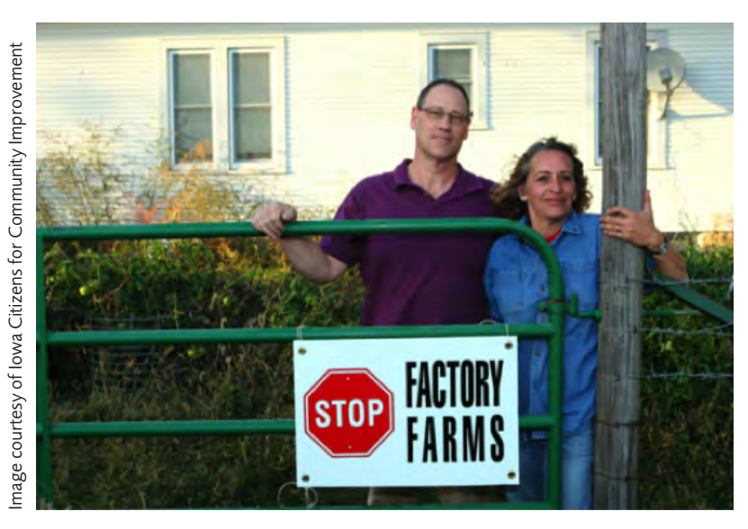
According to Iowa Citizens for Community Improvement, 8,000 factory farms dominate the Iowa landscape, packing thousands of hogs, chickens, and their billions of gallons of manure into one small space in order to maximize profit.

The First Amendment requires that prohibitions on speech be content and viewpoint neutral. Laws that target speech based on content or viewpoint are presumptively unconstitutional and may be justified only if they pass strict scrutiny , a legal test that requires the government to prove that the law in question is narrowly tailored to serve compelling state interests.