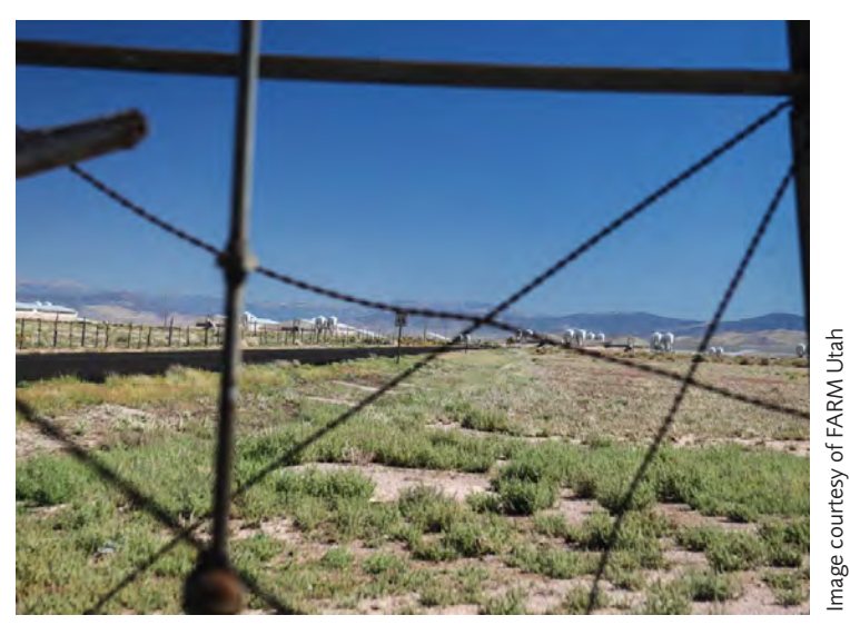
View of the Dale T. Smith and Sons Meat Packing Company in

Violating the recording provision is a class A misdemeanor, and carries a penalty of imprisonment of up to one year and/or a fine of up to $2,500. Violating the other provisions is a class B misdemeanor and can result in imprisonment of up to six months and/or a fine of up to $1,000. 66