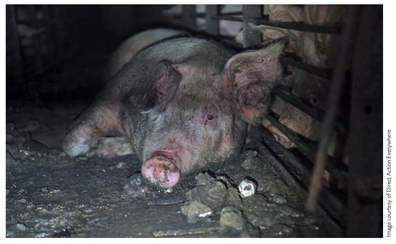
Conditions uncovered at Circle Four Farms in Utah by a Direct Action Everywhere investigation.